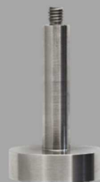
Plate probe 40mm