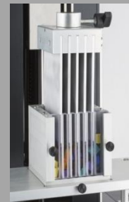
5 blades Kramer cell