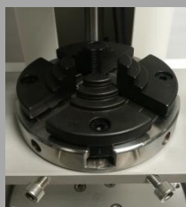
Syringes test bench

Compression speed: 2mm/s Compression distance: variable Detection level: 0.1N