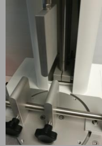
3 points bend fixture + lipstick probe